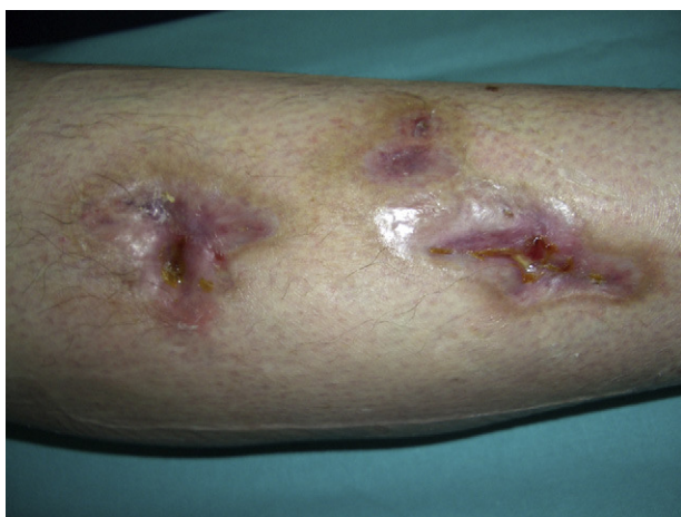
Figure 4 Cutaneous lesions after 3 months. Residual scarring visible on the leg.

Only 23 cases of extensive cutaneous necrosis linked to APS have been reported in the literature. 1,8 Most of the patients have been young women and the underlying diseases included SLE (9 cases), lupus-like disease (1 case), urinary tract infection (2 cases), acquired immunodeficiency syndrome (1 case), rheumatoid arthritis (1 case), mycosis fungoides (1 case), and mixed connective tissue disease (7 cases). Seven patients had no underlying disease. All of the patients developed thrombotic complications limited to skin, and, as in our patient, the lower limbs were the most commonly affected site. Skin biopsy revealed the presence of thrombi in dermal venules and capillaries, with no evidence of vasculitis.