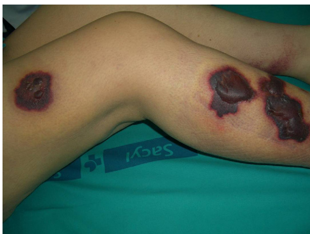
Figure 1 Cutaneous lesions on admission. Bullous erythematous violaceous plaques on the right leg.

A 48-year-old woman presented at the emergency room with a 2-week history of fever, arthralgia, malaise, and chest pain. On examination she was noted to have 3 bullous erythematous violaceous plaques on her right leg (Fig. 1). Her medical history was remarkable for hypothyroidism, systemic lupus erythematosus (SLE), and obsessive-compulsive disorder. Medications included thyroxine, olanzapine, risperidone, and sertraline. Laboratory tests revealed thrombocytopenia (platelet count 25,000) and normal prothrombin and partial thromboplastin times. Lupus anticoagulant was present and the antinuclear antibody titer was 1:320. C3 and C4 levels were normal.