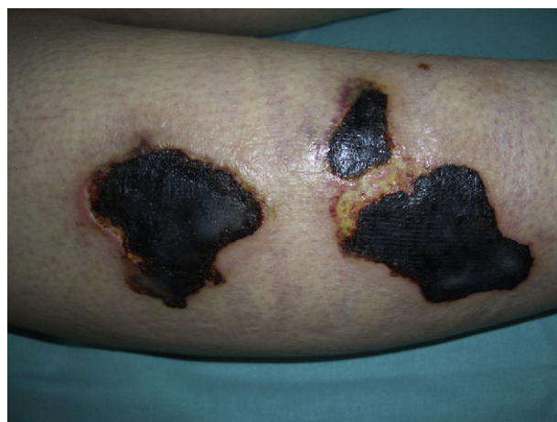
Figure 2 Cutaneous lesions on day 7 of hospitalization. Extensive cutaneous necrosis on the right leg.