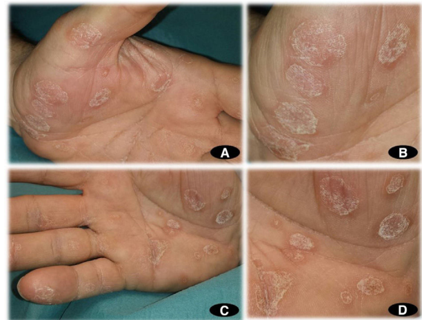
Figure 1 A, Multifocal noncoalescing hyperkeratotic plaques on the palm of the left hand. B, Multiple hyperkeratotic plaques with well-defined edges on the palm of the left hand. C, Multifocal noncoalescing hyperkeratotic plaques on the palm of the right hand. D, Multiple hyperkeratotic plaques with well-defined edges on the palm of the right hand.

A 65-year-old man with no relevant personal or family history was assessed at our department for the gradual appearance of lesions on the palms of both hands, 2 weeks after starting treatment with CBZ at a dosage of 200 mg every 12 h for trigeminal neuralgia, which had recently been diagnosed in the neurology department. The physical examination revealed multifocal hyperkeratotic plaques on both hands (Fig. 1A–D); the lesions were asymptomatic with well-defined margins and did not coalesce. No involvement of the mucosa or soles of the feet was observed. Additional tests, including a blood count, general biochemistry, acute-phase reactants (PCR, VSG), and serology for syphilis, were normal. The patient reported no recent vaccines. Histopathology (Fig. 2) was compatible with keratoderma with no associated inflammatory process. The drug was suspended and replaced with one of a different therapeutic class to manage the patient's neurologic condition. The skin lesions were treated with topical emollients. Follow-up at 4 weeks showed complete clearance of the lesions.