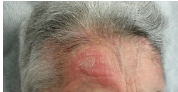
Figure 1 Erythematous–edematous infiltrated plaque measuring 3.5 cm, located on the forehead, corresponding to a lesion due to Leishmania .

An 82-year-old woman visited our department with an erythematous–edematous infiltrated lesion measuring 3.5 cm, with no ulceration or scab, located on the forehead; the lesion was persistent and had appeared some months earlier (Fig. 1). The patient had a past history of rheumatoid arthritis treated with etanercept and prednisone, osteoporosis, scoliosis, mild anemia, seborrheic dermatitis treated with topical corticosteroids, and severe underweight (BMI, 15 kg/m 2 ). A skin biopsy of the lesion revealed granulomatous dermatitis with amastigotes and a diagnosis of leishmaniasis was therefore established. The patient had not traveled outside Spain. It was decided to treat the patient with oral itraconazole for 6 weeks, with