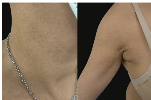
Fig. 1 (a, b) Thin grouped papules with a "cobblestone" appearance over the lateral neck and axilla, resembling pseudoxanthoma-elasticum.

The skin biopsy revealed interstitial dermal infiltration with histiocytes and perivascular lymphocytic infiltrate