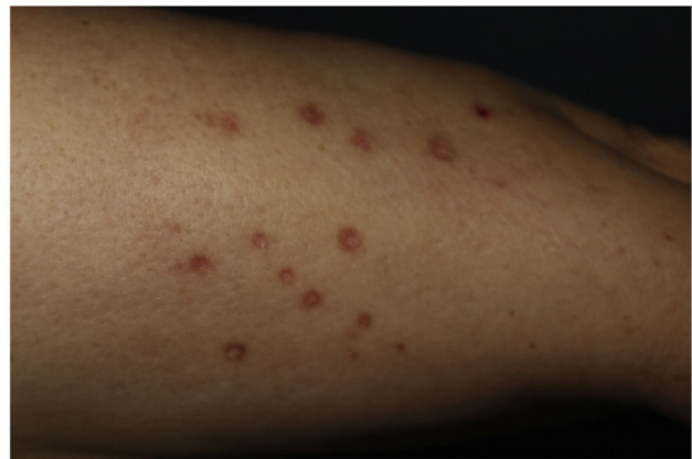
Figure 1 Clinical image. Multiple erythematous-violet, shiny, polygonal papules of up to 1cm in size located on both forearms.

A 15-day systemic course of prednisone plus with topical betamethasone was started—without alirocumab