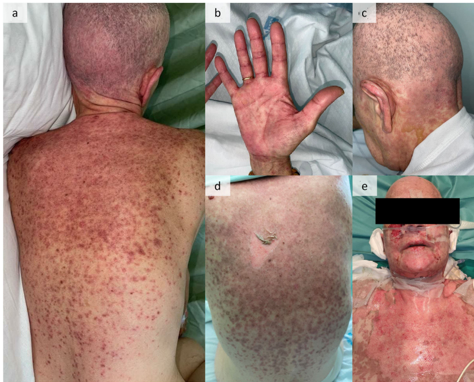
Figure 1 Clinical features. (a–c) Maculopapular rash with trunk, palmoplantar region, scalp, and retroauricular area involvement. (d) Positive Nikolsky’s sign. (e) Epidermal detachment.