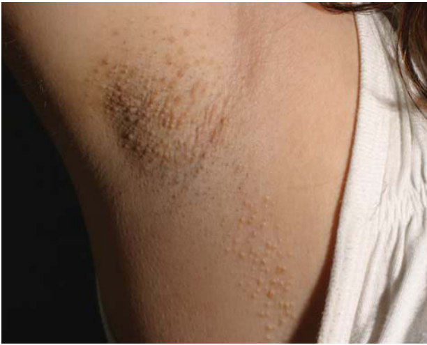
Figure 1. Multiple whitish-yellow follicular papules in the axillary region.