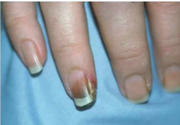
Figure 2. Necrotic lesions affecting the nailbed of the fingers.

dimpling, and had isolated erythematous or violaceous maculopapular lesions. During admission she developed focal acral necrosis with lesions suggestive of vasculitis or occlusive disease below the fingernail of the fourth finger of the right hand (Figure 2) and the first and second toe of the left foot.