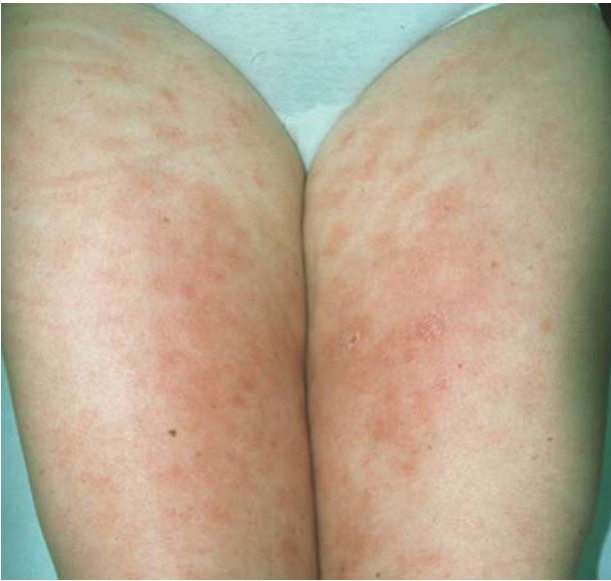
Figure 1. Erythematous edematous sclerotic areas on both legs.