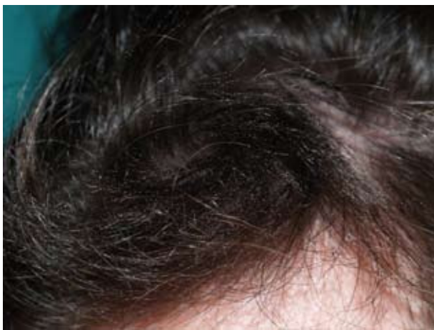
Figure 1. Lock of abnormal hair, with shafts of different lengths, a dry appearance, and the presence of multiple whitish-gray nodules.

Trichorrhhexis nodosa (TN), also known as trichonodosis, was first described by Wilks in 1852. 1 It is the most common of hair dysplasias associated with increased hair fragility. It is considered an anomalous response of the hair shaft to external trauma and is clinically characterized by dry, dull, and brittle hairs of different lengths with varying numbers of small grayish-white or yellowish nodules distributed irregularly along the shaft. 2 These nodular formations are transverse