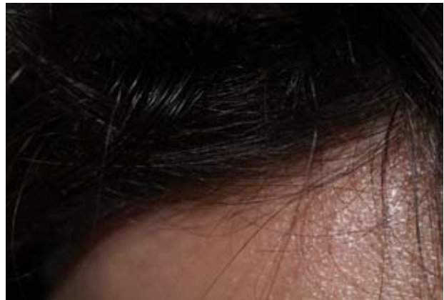
Figure 3. Clear improvement after 6 months. .

Correspondence: Zuriñe Martínez de Lagrán. Servicio de Dermatología. Hospital de Cruces. Plaza de Cruces, s/n. 48390 Cruces, Vizcaya, Spain zurivitoria@yahoo.es