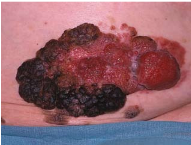
Figure 1. Squamous cell carcinoma on seborrheic keratosis.

The patient was a 94-year-old woman who was seen in our outpatient clinic for a tumor on the abdomen that had been present for 30 years and that had increased in size over a period of months, causing pain and bleeding. On physical examination, a seborrheic keratosis with a maximum diameter of 12 cm was observed. On this lesion there were several hemorrhagic, lobulated tumors (Figure 1). Complete excision of the lesion was performed, with closure by tissue planes and primary suture under local anesthesia. Microscopic examination revealed different histological patterns within the same lesion (Figures 2 and 3), with images characteristic of ulcerated seborrheic keratosis, areas of transition between seborrheic keratosis and Bowen disease, and zones where Bowen disease infiltrated the dermis (invasive squamous cell carcinoma). The histological diagnosis was of invasive squamous cell carcinoma on seborrheic keratosis. Genotyping for human papillomavirus (HPV) was positive for type 59 in 1 of the 4 blocks sent. The patient remains disease-free after 1 year of follow-up in our clinic.