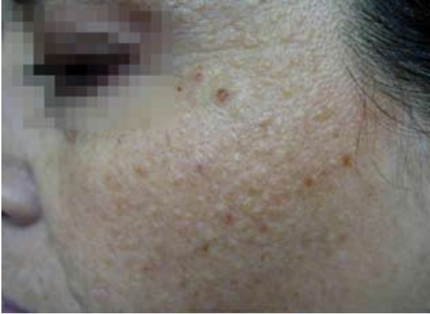
Figure 1. Millimetric, skin-colored papules on the left cheek and temporal region.

The women presented numerous depressed pinpoint scars and multiple, hard, asymptomatic, skin-colored papules of 2 to 3 mm in diameter (Figures 1 and 2). There were no other significant clinical findings.