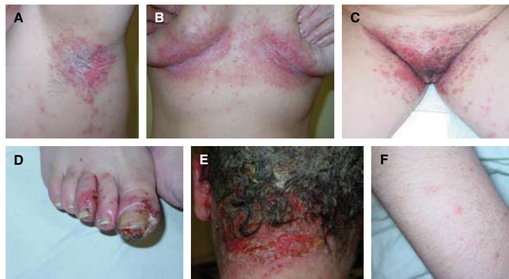
Figure 1. A, B, and C. Scaly erythematous lesions with isolated pustules in large folds. D. Interdigital and periungual folds. E. Pustular and exudative plaques in the scalp. F. An intact pustule.

A number of skin biopsies were conducted, revealing psoriasiform hyperplasia of the epidermis, small subcorneal spongiform pustules with exocytosis of the neutrophils, and a mixed infiltrate in the upper and