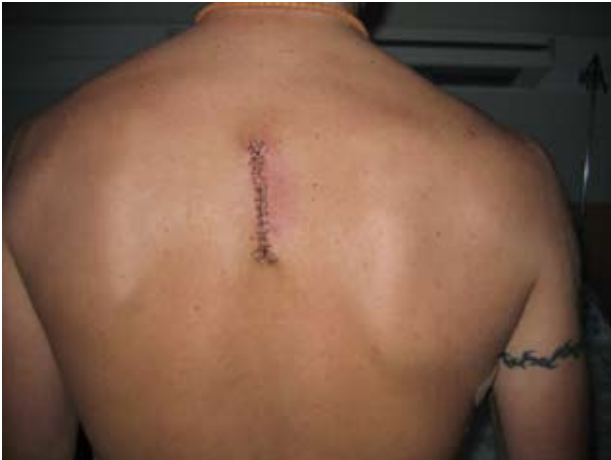
Figure 2. Scar of the widening of the surgical margins of a melanoma in the interscapular region. A tattoo can be seen on the right arm.

to remove tattoos do not eradicate the presence of the pigment in lymph nodes. 3