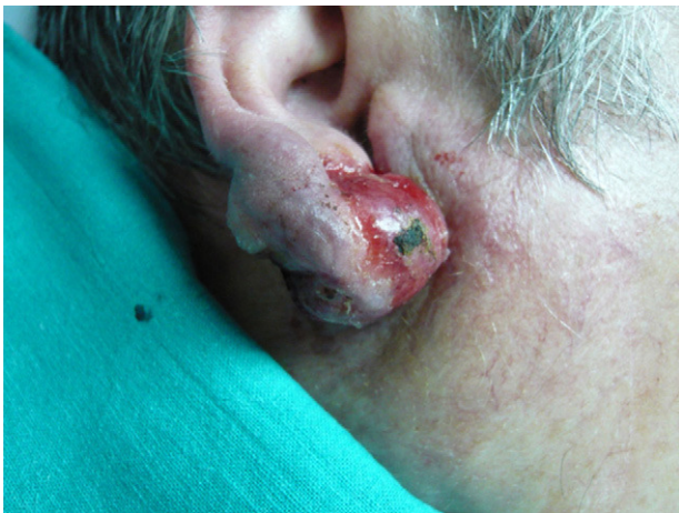
Figure 1 Tumor lesion on right ear lobe.

Inoshita and Youngberg 7 reported 2 cases of malignant fibrous histiocytoma in postsurgical scars showing histologic signs of chronic inflammation, with giant cells that contained particles of suture material. This finding, however, has not been mentioned in other subsequently reported cases.