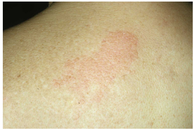
Figure 1 Erythematous papules and plaques on the patient's back.

The patient was diagnosed with sarcoidosis and CREST syndrome (calcinosis, Raynaud phenomenon, esophageal dysmotility, sclerodactyly, and telangiectasia), a type of systemic sclerosis. After treatment with prednisolone (60 mg/d) and nifedipine (10 mg/12 h), the clinical and radiographic aspects of the skin and lung involvement related to sarcoidosis improved. Azathioprine (100 mg/d) was later added to the regimen. The dose of prednisolone