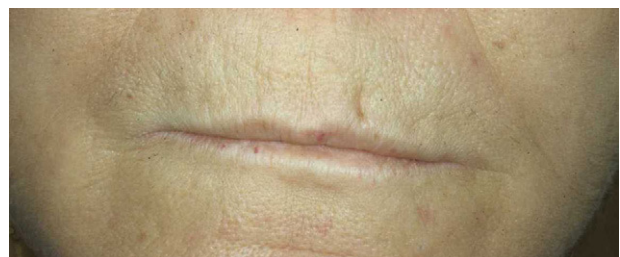
Figure 2 Telangiectasis on the lips.

It is important to emphasize that it can be difficult to differentiate between these 2 diseases because the respiratory manifestations may be similar. 4,6 Skin tests play a crucial role in the diagnosis of both processes. In our patient, histopathologic examination of the skin lesions confirmed sarcoidosis. We found only 1 case of cutaneous sarcoidal granulomas in the literature. 8 In the present case, a thorough examination of the skin revealed systemic sclerosis (CREST syndrome). Whether concomitant sarcoidosis and autoimmune disease is a mere coincidence or the result of a common pathogenic mechanism has not been clearly established. 3-6 Cox et al. 3 and Takahashi et al. 8 suggest that these 2 entities are probably the result of different