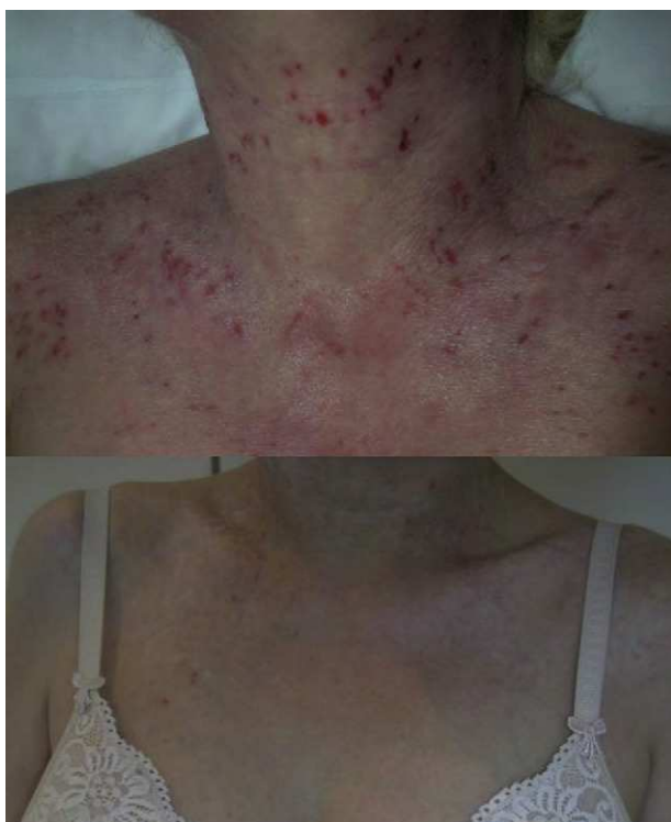
Figure 2 Clinical image of one of our patients before and after treatment with omalizumab in monotherapy (lower image: 2 months after starting treatment).

after a good initial clinical response. At the time of writing, 1 patient was still receiving treatment and had almost no lesions (Fig. 2). The reasons for the discontinuation of treatment are shown in Table 2. One patient developed ductal breast cancer, and it was therefore decided to interrupt