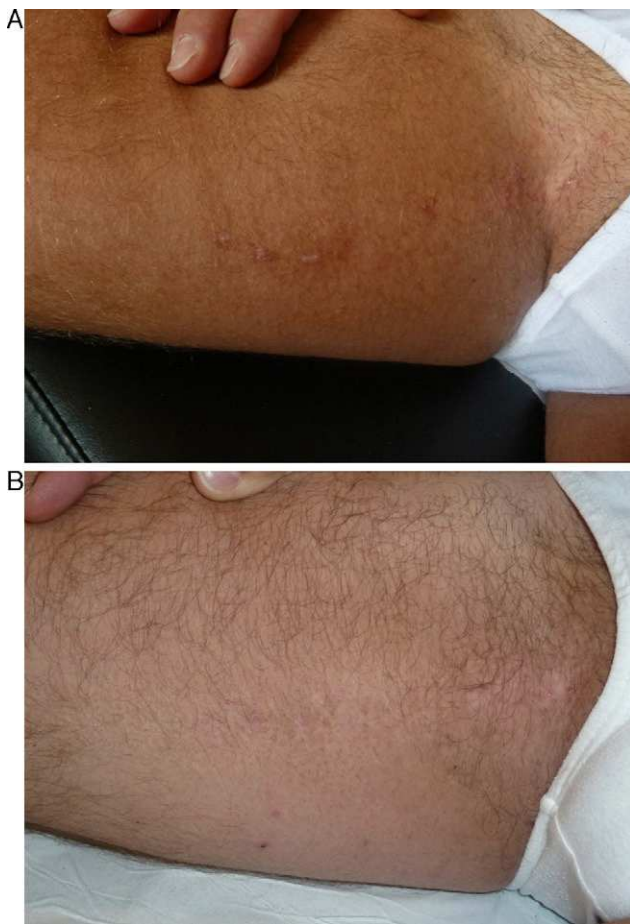
Figure 4 Inflammatory linear verrucous epidermal nevus on the right thigh (Patient 8), before (A) and after (B) carbon dioxide laser therapy.

will develop. The principle limitation of this modality is that treating very extensive lesions will require scheduling several sessions. No safe, noninvasive alternatives are currently available for ILVEN, however, even though firm proof of the efficacy of laser therapy for these lesions is limited at this time. CO 2 laser therapy, therefore, might be a good option to consider in certain cases or it might be useful as a palliative treatment to attenuate symptoms. We believe it is essential to have information about the experiences of various centers with large series of patients in order to perfect the way the procedure is carried out and to optimize our treatment of these nevi.