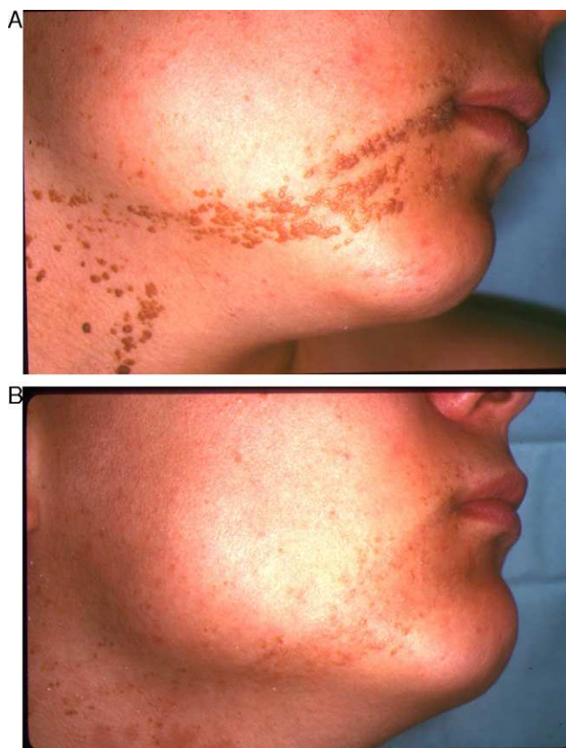
Figure 1 Epidermal nevus on the face (Patient 20), before (A) and after (B) carbon dioxide laser therapy.

On analysis of the relationships between therapeutic response and certain nevus characteristics, we saw that the response was less satisfactory in patients with a diagnosis of ILVEN (3 had a rate of response of less than 50%). Extension, location, and thickness were also considered. Response was better when lesions affected an area measuring less than 20 cm 2 (excellent response in 5 of the 7 patients with small VEN) and when lesions were on the face and neck (excellent response in 5 of 6 patients with VEN in these locations) (Figs. 1–3). No clear link between thickness and response was observed.