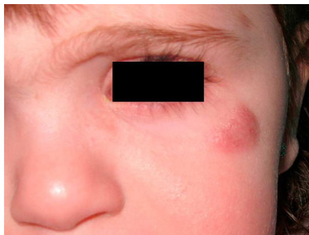
Figure 1 Asymptomatic red to violaceous nodule in the upper region of the left cheek.

Cultures for bacteria, fungi, and mycobacteria were negative. Histopathologic study of a 3-mm punch biopsy of the lesion revealed marked inflammation affecting the full thickness of the dermis. The inflammatory infiltrate was composed of histiocytes, either isolated or forming poorly defined granulomas, and some multinucleated giant cells interspersed with lymphocytes, plasma cells, and neutrophils. No suppurative granulomas were observed. In addition to hematoxylin-eosin staining, other special techniques involving staining with methenamine silver, periodic acid Schiff, Gram, Ziehl-Neelsen and Fite Faraco were used to rule out an infectious etiology (Fig. 2).