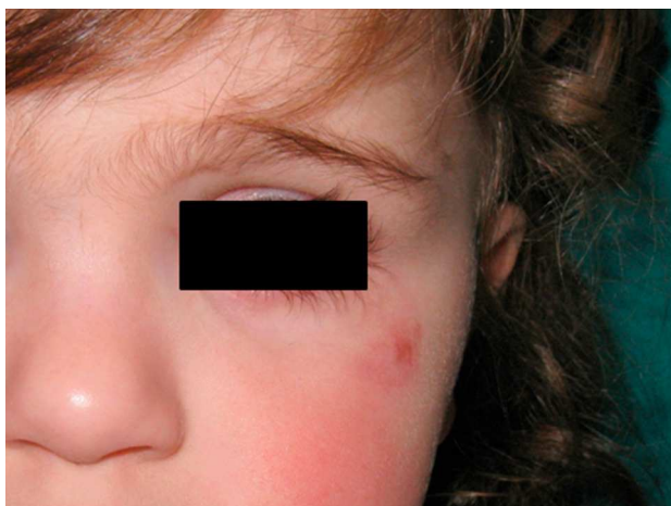
Figure 3 The lesion resolved spontaneously leaving a residual pink macule.

The exact etiology of IFAG is unknown, although Boralevi et al. 2 have postulated that these lesions may be related to a granulomatous process around an embryological remnant or may belong to the spectrum of granulomatous rosacea in infants. A prospective multicenter study of 30 cases by the same authors reported the mean duration of the lesions to be 11 months and found antibiotic treatment ineffective.