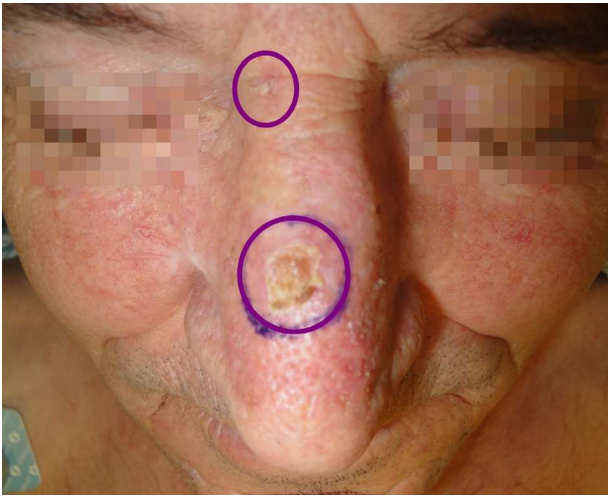
Figure 1 Basal cell carcinomas on the dorsum and root of the nose. The circles indicate the size of the surgical defects after excision with adequate margins.