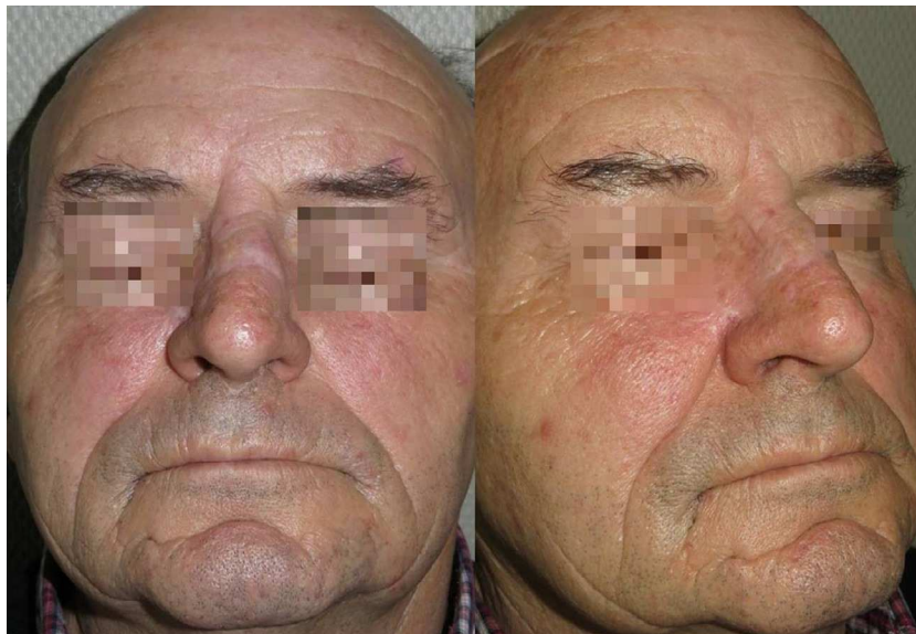
Figure 2 Postoperative result 12 months after the operation.