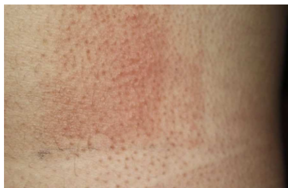
Figure 3 Photoprovocation.

The following photoprovocation protocol has been proposed for polymorphic light eruption (PLE): irradiation of a previously exposed area of skin measuring 5 × 8 cm for 3 consecutive days with polychromatic UV-A light at a dose of 60 to 100 J/cm 2 (Fig. 3) and polychromatic UV-B light at a dose of 1.5 times the UV-B MED, with reading of results at 24 and 72 hours. 2 Other authors have successfully provoked lesions on the arms of patients with PLE using lower UV-A doses (10-20 J/cm 2 for 4 days) and narrowband (NB) UV-B therapy (0.4 and 0.8 J/cm 2 for 2-4 days). They used fluorescent UV lamps fitted in a cylindrical device into which the patients' arms were placed. 3 It is important to distinguish between PLE lesions and erythema when using UV-B radiation. The best