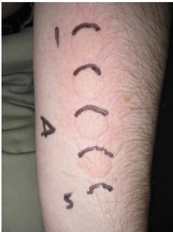
Figure 2 Minimal urticaria dose (MUD) in a patient with solar urticaria.

Whealing response. MUD determined using a fluorescent lamp with 5 test fields and a filter to determine the exposure dose according to skin contact time (Gigatest UVB, Medisun).