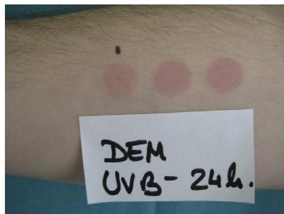
Figure 1 Phototest. Minimal erythema dose (MED) for UV-B radiation.

Because practically 100% of effective erythema-producing radiation is UV-B radiation, broadband fluorescent UV-B lamps are generally used for phototesting. However, while these lamps offer stable output, are simple to use, and are relatively cheap, their spectral region is far from that of natural sunlight. Solar simulators offer the best spectral match in this respect because, when fitted with appropriate interference filters, they closely approximate