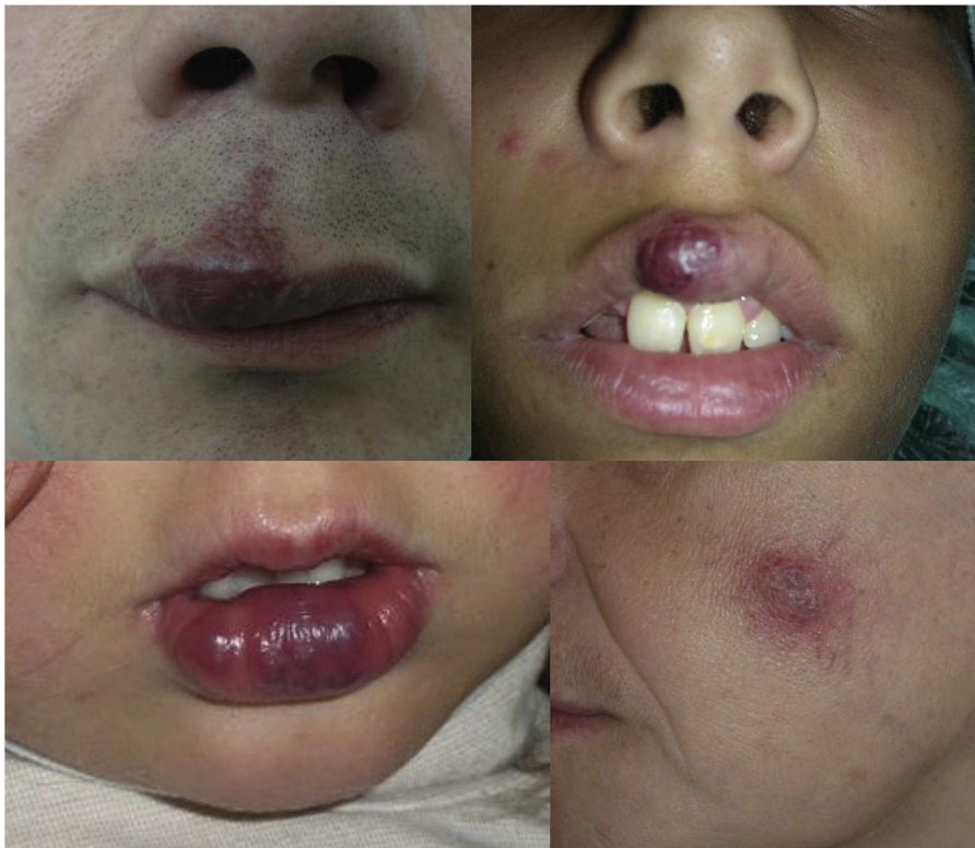
Figure 1 Atheriovenous malformations. Lesions can progress rapidly at birth or appear later.