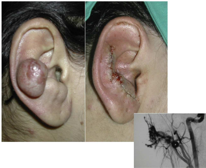
Figure 7 Ateriovenous malformation. Surgical treatment.

Surgical excision with free margins is extremely difficult when the AVM is situated in a critical area, such as the face, or in the case of diffuse, poorly delimited lesions or ones that invade neighboring structures. In these cases, the best option, when feasible, is observation; surgical excision would probably be incomplete and there is a risk of recurrence or exacerbation. Should surgery be performed, the primary objectives are symptom relief, the preservation of vital functions, and improvement of deformities. Thanks to the advances in endovascular techniques and the materials now available, surgery can be less aggressive. Furthermore, it should not be forgotten that when an intervention is performed late, it will be more complex and will be less likely to be curative.