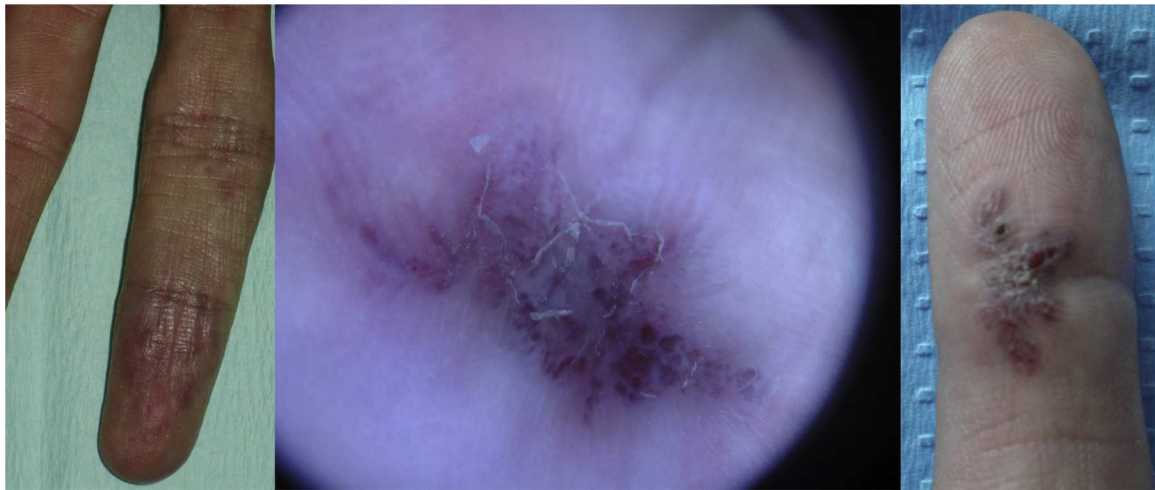
Figure 3 Acral arteriovenous malformations. These may arise after trauma.

Lesions diagnosed after 40 years of age may sometimes be acquired, particularly after trauma, as may occur in acral regions (Fig. 3). 21 These appear to be reactive lesions and they are not influenced by the hormonal changes that affect lesions diagnosed early in life.