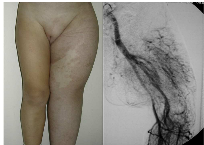
Figure 8 Parkes-Weber syndrome: generalized hypertrophy of a limb associated with an arteriovenous malformation.

Embolization is performed 24 to 72 hours prior to surgery in order to reduce blood loss. However, some interventional radiologists perform percutaneous transarterial and transvenous embolization simultaneously, as the only treatment, achieving results similar to surgery, particularly in complex sites such as the head and neck 44 ; however, this usually requires several interventions. In contrast, embolization via a single access route in the hands of an inexperienced radi-