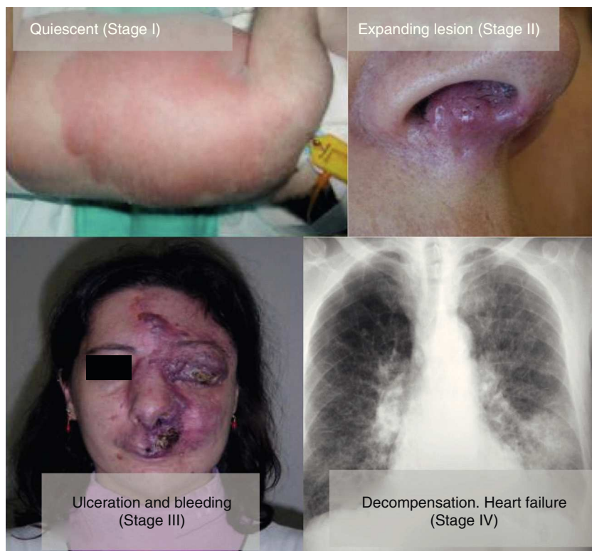
Figure 4 Schöbinger stages.

Progression of the lesions is evident as an increase in the communication, giving rise to arterial steal and venous