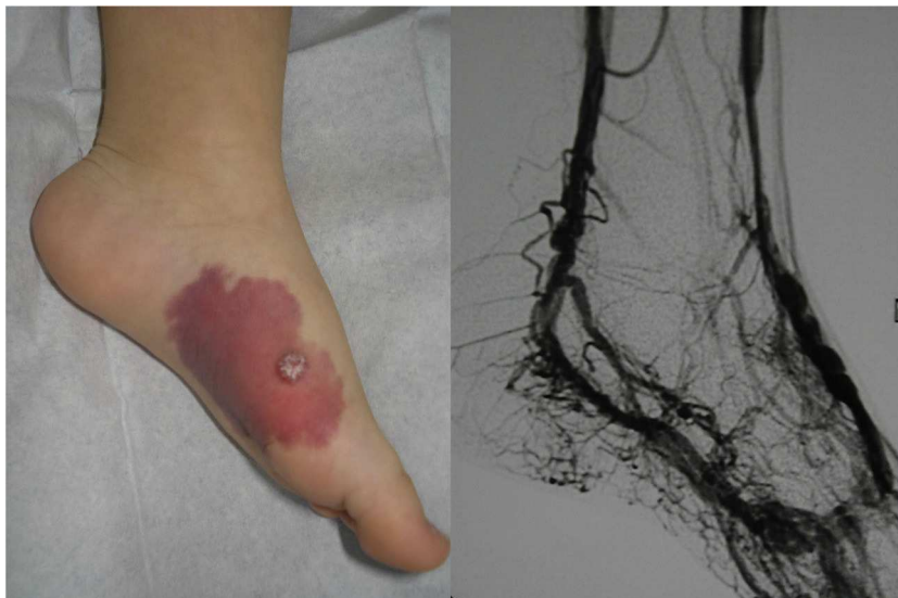
Figure 5 Nodular lesion of recent appearance on a capillary malformation. Arteriovenous malformation.

The clinical manifestations and even the usual diagnostic tests cannot differentiate between the 2 entities at such an early age; it is the clinical course of the lesions that gives us the definitive diagnosis in the majority of cases. This difficulty should soon be resolved thanks to the latest advances