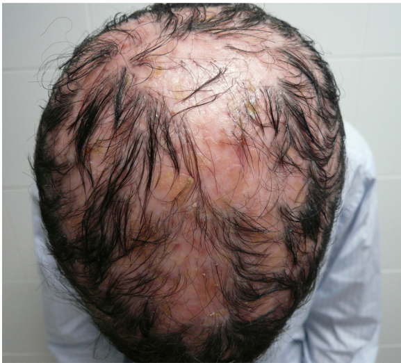
Figure 3 Second bout of type I pityriasis rubra pilaris. Large patches of scarring alopecia with follicular flaking and patchy perifollicular erythema that developed into atrophic pearly patches without erythema or scaling.

cia might have been induced by the follicular involvement characteristic of PRP.