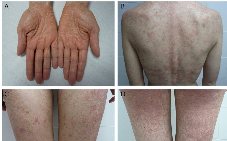
Figure 1 First bout of type I pityriasis rubra pilaris. A, Waxy palmar keratoderma. B-D, Scaly, orange-red patches on the trunk and limbs with islands of sparing and marked follicular hyperkeratosis.