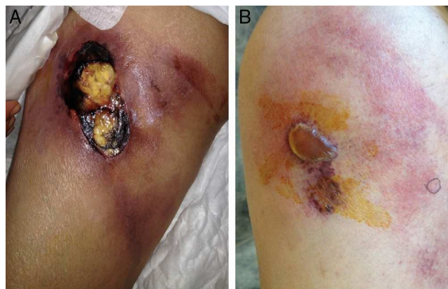
Figure 1 A, Indurated erythematous plaque with a central ulcer on the anterior aspect of the right thigh. B, Indurated erythematous plaque on the lateral aspect of the right thigh; there is a central blister of serous fluid with a necrotic base.

Two patients on hemodialysis for chronic kidney failure developed fever. The first patient was a 53-year-old woman who was seen for a painful and indurated necrotic plaque that had developed 20 days earlier on the anterior aspect of the right thigh (Fig. 1A). The relevant findings in the laboratory tests were calcemia, 8.6 mg/dL, and parathyroid hormone, 569 pg/ml. On computed tomography there were areas of calcification in the subcutaneous cellular tissue beneath the lesion, and skin biopsy was compatible with calciphylaxis. Treatment was started with sodium thiosulfate 20 mg/48 h and meropenem 500 mg/12 h but the lesions did not improve and the patient died. The second patient was a man aged 56 years who was seen for an indurated, painful plaque on the lateral aspect of the thigh. The plaque had a central blister of serous fluid with a necrotic base (Fig. 1B). Histopathology revealed necrotizing panniculitis and Pseudomonas aeruginosa was cultured from the skin biopsy. The patient was diagnosed with ecthyma gangrenosum and the lesion healed after 10 days of treatment