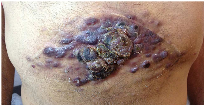
Figure 1 Presternal plaque of 15 x 30 cm formed by the coalescence of multiple erythematous-violaceous tumors with maximum individual diameters of 2-3 cm.

Unidad de Gestión Clínica de Dermatología Médico Quirúrgica y Venereología, Hospital Universitario Virgen de las Nieves, Granada, Spain