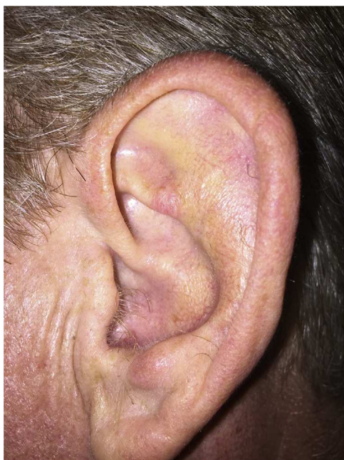
Figure 3 Resolved lesion 1 year after the patient started using a hands-free device.

patient, the use of a hands-free device to avoid recurrent trauma in the region was sufficient to cure the lesion.