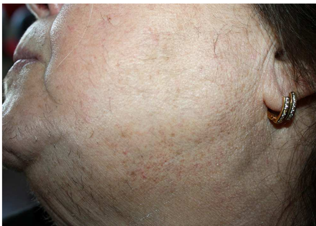
Figure 2 Hirsutism affecting the chin and sides of the face and neck.

Alopecia and hirsutism can be the presenting manifestation of a tumor, 2 as shown by the case reported herein. Hilar Leydig cell tumors of the ovary are very rare and account for just 0.5% of all ovarian tumors. Accordingly, very few cases have been described in the literature. Although benign, these tumors frequently cause virilization, with increased androgen production, 3-5 and they are also associated with an increased risk of thromboembolism. 6 Leydig tumor cells in the ovary can be very small and may go undetected in imaging studies. This is why adnexectomy is frequently per-