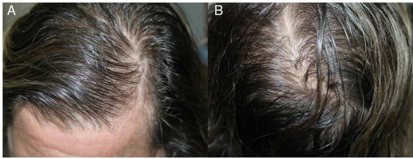
Figure 1 A, Triangular-shaped frontoparietal hairline recession. B, Hair thinning on the crown.

Considering the physical findings, we requested blood tests with complete blood count, biochemistry, erythrocyte sedimentation rate, thyroid hormones, and iron profile. The results were all within normal ranges. A hormone study showed hyperandrogenism, with elevated testosterone levels (4.06 ng/mL; normal range, 0.20-0.80 ng/mL). The tests also showed a level of 28 nmol/L for sex hormone binding globulin (normal range, 11-124 nmol/L) and a free testosterone index of 45 (normal range, 1.6-6). Free testosterone is the biologically active fraction of testosterone. Androstenedione, dehydroepiandrosterone sulfate, and 17-hydroxyprogesterone levels were all within normal limits. Estradiol levels were high due to peripheral aromatization of testosterone.