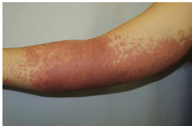
Figure 1 Targetoid erythematous macules on the forearm.

The suspected diagnosis was erythema multiforme contact dermatitis. Oral prednisone was prescribed, and the lesions improved gradually until they had completely resolved 2 weeks later leaving only scaling. A few hours after