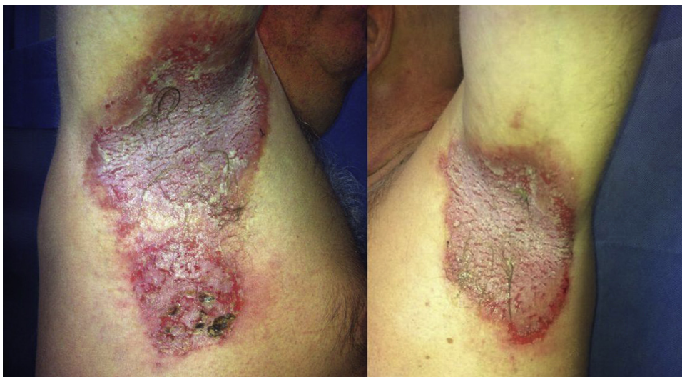
Figure 1 Erythematous, erosive, and highly exudative plaques with surface crusts in the axillas.