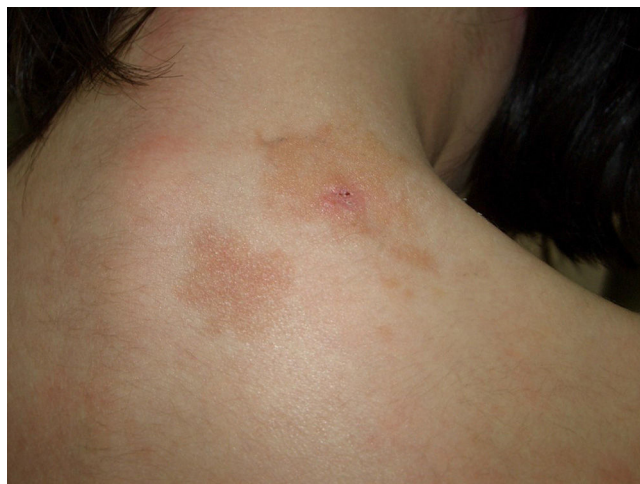
Figure 2 Plaque-type cutaneous mastocytosis.