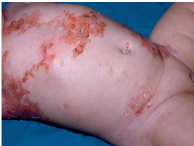
Figure 4 Diffuse cutaneous mastocytosis in an infant. Spontaneous formation of vesicles and blisters triggered by rubbing.

The term diffuse cutaneous mastocytosis has been used to refer to mast cell lesions with extensive cutaneous involvement, and as such, it encompasses maculopapular lesions and/or very extensive nodular lesions, as well as generalized erythrodermic forms. 14