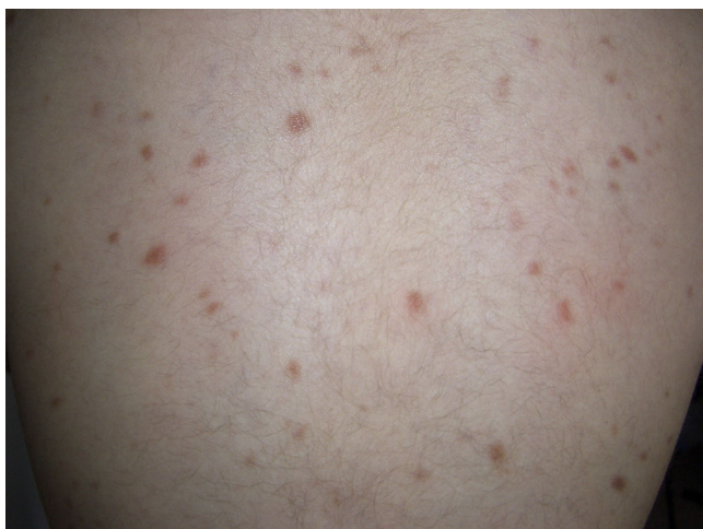
Figure 1 Maculopapular cutaneous mastocytosis.

is characteristic of pediatric mastocytosis, although isolated cases have been described in adults. 9,10 In one series of 33 children, 60% of mastocytomas were found to be congenital and over half were located on the extremities, but sparing the palms and soles. 11 The clinical manifestations tend to be cutaneous and confined to the lesion or lesions involved; they include mild pruritus, blisters (reported only in infants and young children), and urticaria caused by rubbing or friction. A positive Darier sign 12 is diagnostic of mastocytosis, but friction can also induce acute systemic lesions due to the release