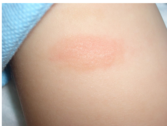
Figure 3 Nodular mastocytosis (solitary mastocytoma).