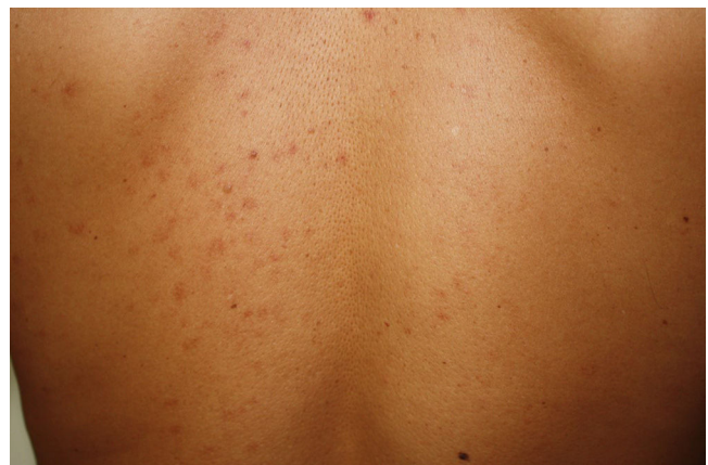
Figure 5 Telangiectatic cutaneous mastocytosis.

The above classification of cutaneous mastocytosis has considerable limitations in terms of clinical presentation