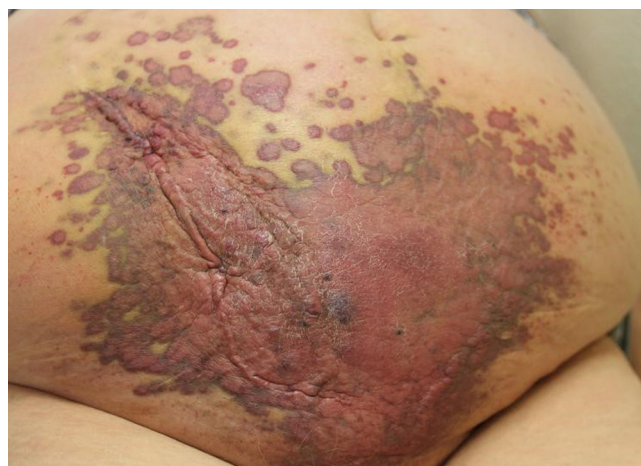
Figure 1 Large bruise-like reddish-purple plaque covering nearly the entire lower half of the abdomen.

survival rate of 50% to 60%. 1 Mean survival after diagnosis ranges from 18 to 28 months. 2 Three types of angiosarcoma are traditionally described. The first is idiopathic cutaneous angiosarcoma, which appears on the head and scalp of older patients. 3 The second and third are angiosarcoma secondary to chronic lymphedema (Stewart-Treves syndrome) and a type that appears in skin exposed to radiotherapy. This tumor generally presents as a lesion that resembles bruising, with erythematous-violaceous nodules. The various types