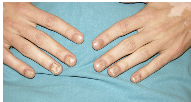
Figure 2 Nail dystrophy in the form of trachyonychia with longitudinal ridges.

typical of lichen nitidus. There was mild epidermal atrophy and parakeratosis at the center of the papule (Fig. 3).