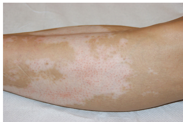
Figure 1 Small erythematous papules limited to an achromic macule of vitiligo on the patient's leg.

Histology of the skin lesions revealed a lymphohistiocytic infiltrate in the papillary dermis limited laterally by downward extensions of the epidermis, forming the pattern