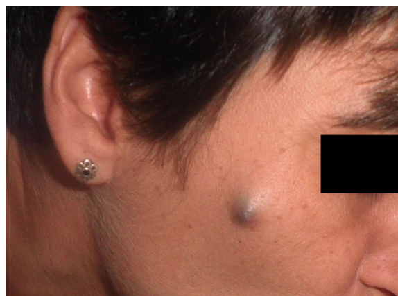
Figure 1 Nodule on the right cheek.

The lesion was completely removed, and histopathology revealed a multinodular skin lesion that was well defined with cellular atypia, mitosis, and areas of necrosis. The lesion was not connected to the follicular epithelium or