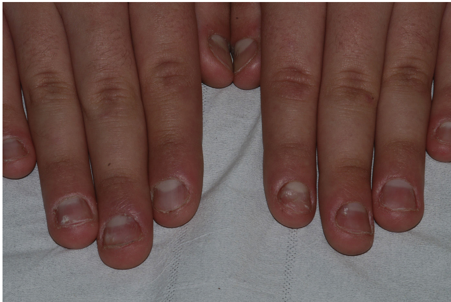
Figure 2 Rough and brittle surface of all the nail plates, although less evident in the fifth fingers. Oil spots and pinpoint leukonychia are visible.

rise to irregularities in the nail plate. 3 The few histopathological studies reported show inflammation and granulation tissue. 2,3