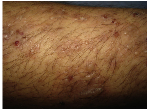
Figure 2 Branching vesicles on healthy and erythematous skin. Crusts and erosions on the right leg.

Treatment was started with methylprednisolone at 1 mg/kg/d, which was subsequently complemented with mycophenolate mofetil. Corticosteroids were tapered until discontinuation. Since the active lesions had resolved after 2 years, treatment was discontinued.