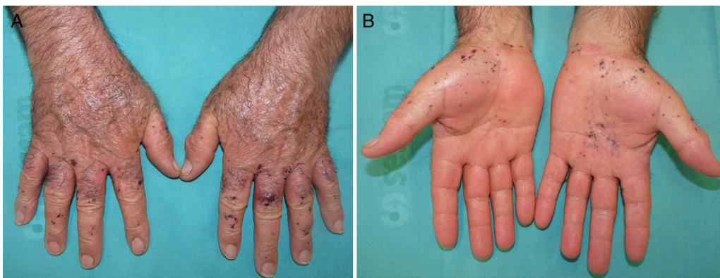
Figure 1 A and B, Macules, papules, and a hemorrhagic blister on the back of hands, the palms, and the wrists.