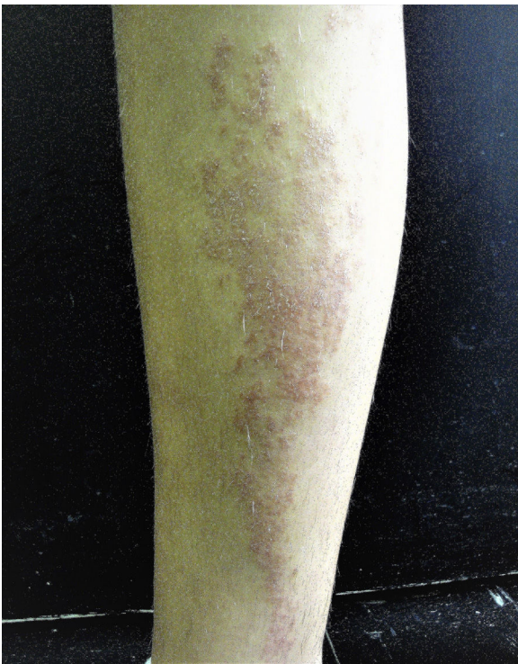
Figure 1 Clinical photograph of a patient with lichen striatus.