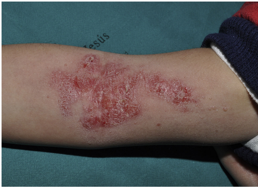
Figure 4 Irritation caused by the application of topical imiquimod on the right forearm.

intralesional candidin, complete resolution was observed in 14 (56%) cases, a partial response in 7 (28%), and no clinical improvement in 4 (16%). 39 The advantages of immunotherapy in the treatment of MC include the induction of a memory immune response to MC, the potential to induce a generalized response that leads to resolution of untreated lesions in anatomically distant sites, and the lack of adverse effects. 40 However, candidin, which is not commercially available in Spain, is scarcely used in clinical practice.