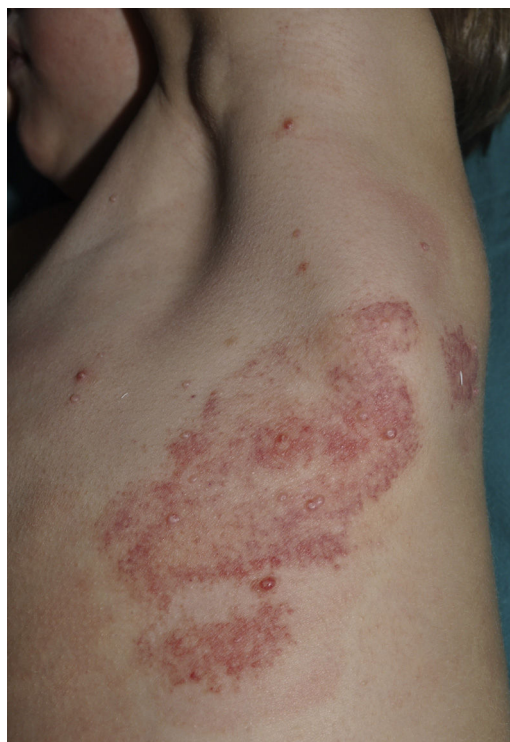
Figure 2 Purpuric reaction to topical application of EMLA (eutectic mixture of local anesthetics) cream and occlusion for 1 hour.

The umbilicated nucleus of the lesion can be manually removed using the hands or any one of a variety of instruments, including a scalpel, lancet, insulin needle, slide, or forceps (Fig. 3). The resulting scarring is similar to that caused by curettage. This technique is of particular interest as it is simple and fast and can be learned by patients, family members, and caregivers and therefore performed at home. 11