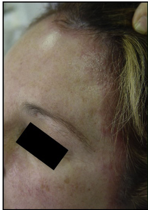
Figure 2 Acute eczema on the forehead and hairline after application of hair dye.