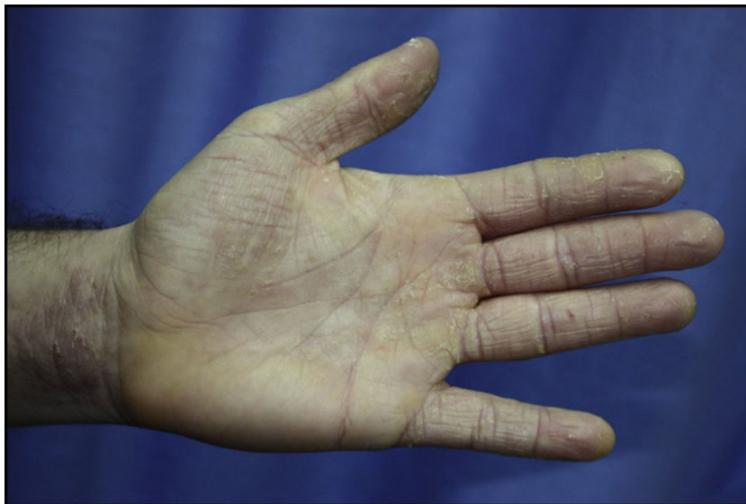
Figure 4 Chronic hyperkeratotic eczema affecting the palm, palmar surface of the fingers, and anterior surface of the wrist in a hairdresser with positive results to paraphenylenediamine and thiuram in patch tests.