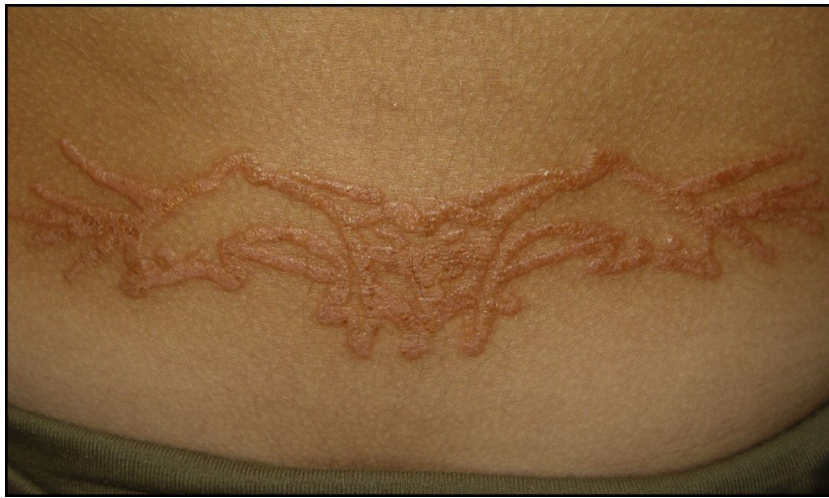
Figure 3 Eczema over a henna tattoo. The limits of the eczema are marked by the lesions.