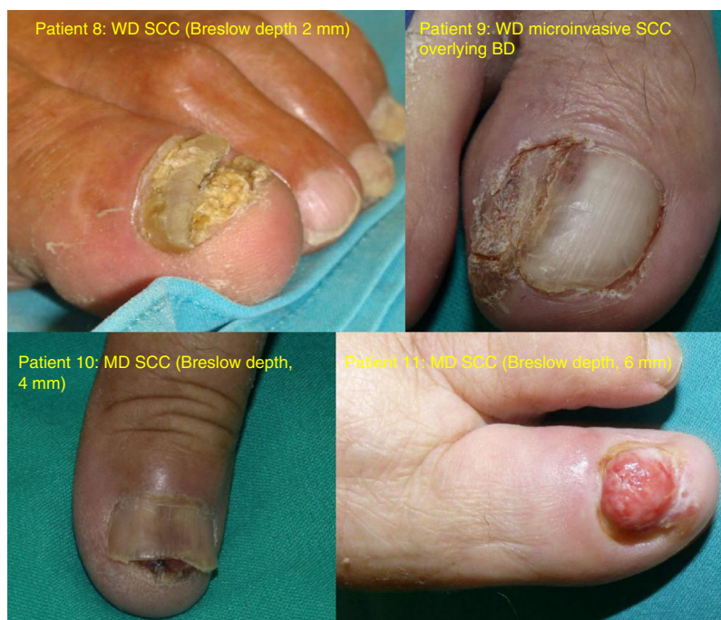
Figure 5 Photographs of the 4 subungual SCCs. MD indicates moderately differentiated; SCC, squamous cell carcinoma; WD, well-differentiated.