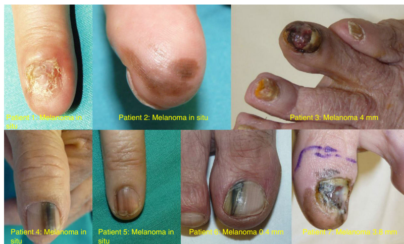
Figure 4 Photographs of the 7 subungual melanomas in our series.

months). This time was similar for SUMs (37.1 months) and SUSCCs (31.5 months). Diagnosis was confirmed by biopsy in all cases, and the 4 patients with SUSCC additionally underwent bone radiography, which was normal in all cases.