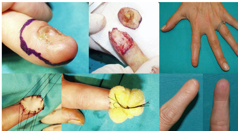
Figure 1 Case 1. Functional surgery with wide local excision of the nail unit in a patient with amelanotic subungual melanoma in situ and complete onychodystrophy of the left index finger. Results after 2 years.

to prevent damage to the extensor tendon at the point of insertion into the base of the distal phalanx. The excised specimen is oriented appropriately and marked with a silk suture for detailed histopathologic examination. After removal of the tourniquet, the wound is irrigated with normal saline solution and conservative hemostasis is achieved. This procedure leaves a quadrangular defect, which can be reduced in size by dividing the vertical septa, allowing the soft tissue to be advanced circumferentially and dorsally (paronychia flap advancement); additional advancement is made possible by sutures at the 4 corners (Figs. 2 & 3), reducing the size of the surgical defect even further. The rest of the defect is reconstructed using a regeneration template and closed with a full-thickness skin graft (Figs. 1-3).