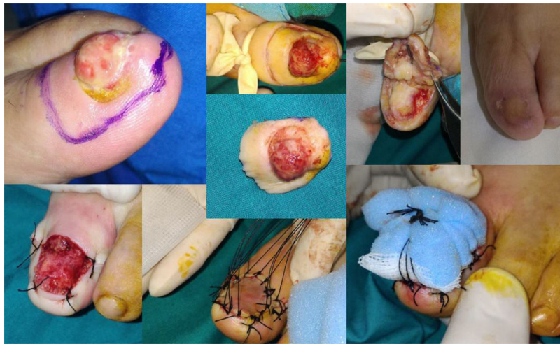
Figure 3 Case 11. Functional surgery with wide local excision of the nail unit in a patient with a moderately differentiated subungual squamous cell carcinoma with a thickness of 6 mm on the first toe of the left foot. Note the excrescent tumor in the area of the onychodystrophy. Result after 4 months.