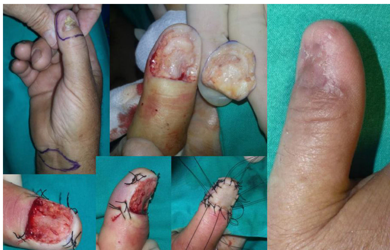
Figure 2 Case 10. Functional surgery with wide local excision of the nail unit in a patient with a moderately differentiated subungual squamous cell carcinoma with a thickness of 4 mm and extensive onychodystrophy of the right thumb. Result after 6 months.

Over the 10-year period, 11 MSUTs (7 SUMs and 4 SUSCCs) were excised from 5 women and 6 men, all white, aged between 45 and 81 years (mean age, 61 years). The clinical characteristics of the patients (Figs. 4 and 5) and the excised tumors are shown in Table 1. Mean time from onset of symptoms to diagnosis was 35.1 months (range, 6-120