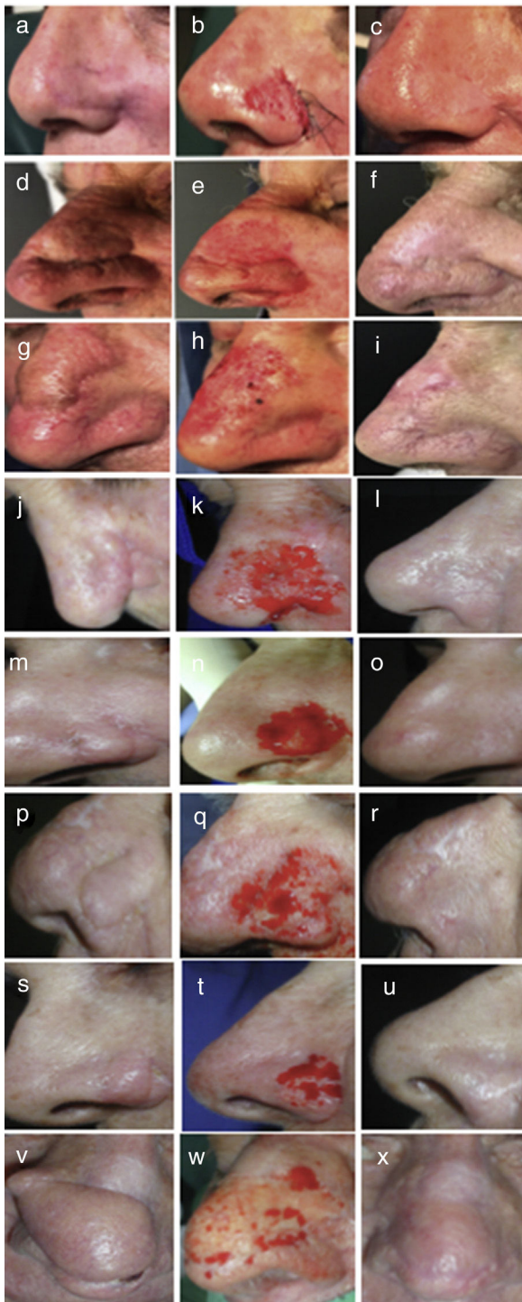
Figure 2 Postoperative outcomes of super shaving. A, D, G, J, M, P, S, V, We can see the trapdoor defect prior to surgery. B, E, H, K, N, Q, T, W, The intraoperative outcome of the technique is shown. C, F, L, O, R, U, X, Postoperative control at 3 months. I, Postoperative control after 1 month.

follow-up is necessary to assess the future complications of the super shaving technique.