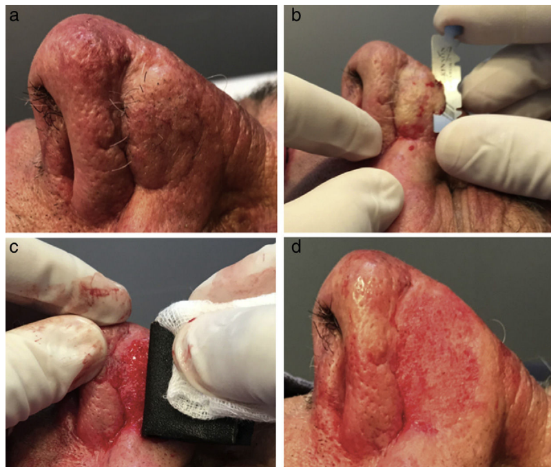
Figure 1 Super shaving technique. A, We can see the trapdoor defect as a complication of transposition pedicle flap closure. B, With one half of a razor blade, the entire bulging part is shaved. C, The surrounding tissue is leveled with 150 grit wet/dry sandpaper embedded in saline solution. D, The outcome on finishing the procedure is shown.