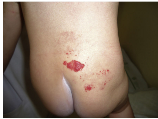
Figure 1 Segmental lumbosacral hemangioma with deviation of the middle line to the left side.

In 2006, Girard et al. 14 proposed the acronym PELVIS syndrome (perineal hemangiomas, external genitalia malformations, lipomyelomeningocele, vesicorenal abnormalities, imperforate anus, and skin tag) to describe 2 cases with extensive sacral and perineal hemangiomas associated with severe malformation of the external genitalia, urinary tract and imperforate anus. After this publication, other acronyms have been proposed to describe similar clinical entities, with the name of SACRAL or LUMBAR syndrome. 15-17 In the literature, most described cases of hemangiomas with associated malformations are those with extensive cutaneous lesions, affecting an important area of the perineum or lumbosacral area, in which the neuroimaging study is expected to be made, 14 although when to do it is not clear. Nevertheless, when the lesions are little in size, do not deviate the middle line or have no additional signs or symptoms, the management and evaluation is not well established