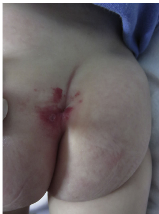
Figure 4 Four cm ulcerated hemangioma in the intergluteal fold.

At the clinical examination he had a 4 cm ulcerated hemangioma in the intergluteal fold (fig. 4). The lesion did not deviate the middle line. The mother referred that the lesion ulcerated 2 days before the dermatological revision. He had no other clinical sign or symptom. After a normal physical exam he started treatment with propranolol with good tolerance.