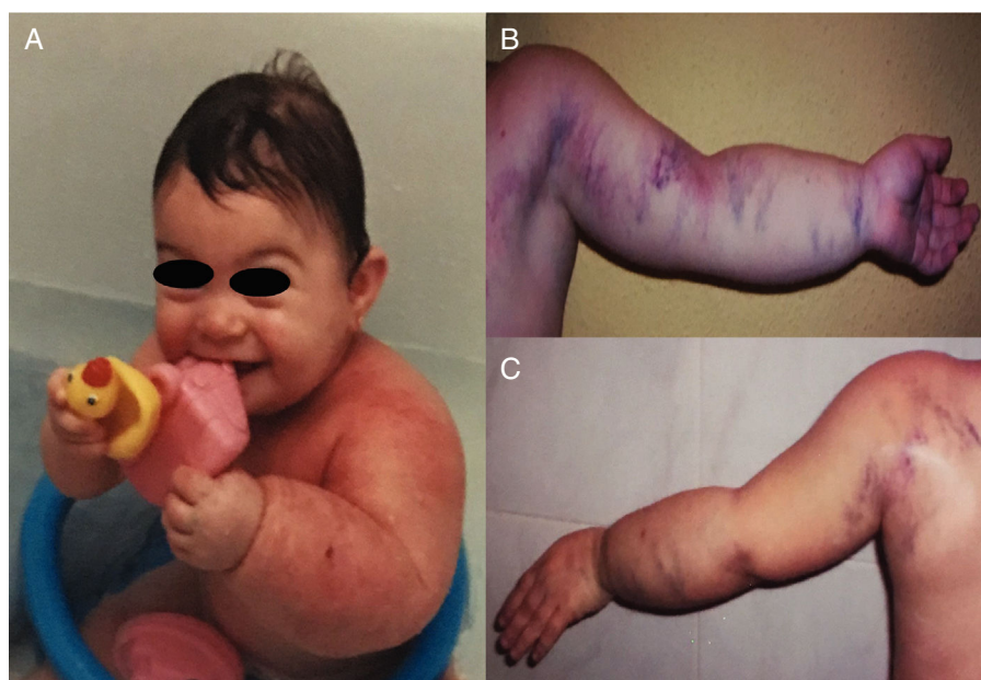
Figure 1 A, Limb asymmetry with overgrowth of the left arm. B and C, Capillary and venous vascular malformations on the anterior and posterior aspects of the arm.

during the first months of life revealed telangiectatic and purpuric vascular lesions (Fig. 1A) accompanied by multiple visible capillaries and venous vessels (Fig. 1B and C) on the left arm, the diameter of which was enlarged. No skin lesions indicative of TSC were observed. Doppler ultrasound performed at 20 days of age revealed no alterations of the arterial or deep venous systems. At 4 months of age, a deep skin biopsy, which included muscle, showed enlargement of the blood vessels in the dermis and subcutaneous