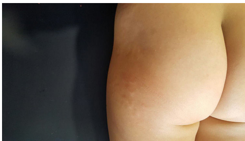
Figure 1 Clinical image. Skin of the lower trunk, hip, and right buttock, with plaques with a mammillated surface, indurated to touch, with no changes in color or hair follicle loss.

Blood work up and C reactive protein were normal, and antinuclear antibodies, anti-DNA, and anti-ENA were negative.