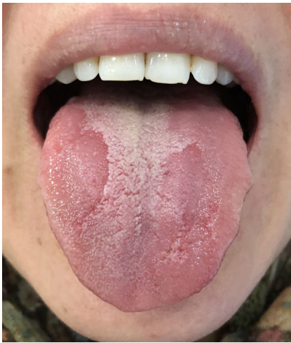
Figure 1 Erythematous plaques in absence of filiform papillae.