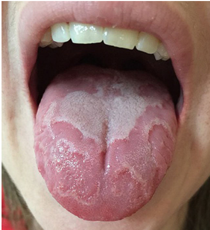
Figure 2 Erythematous plaques with a well-defined whitish margin on the dorsal of the tongue.