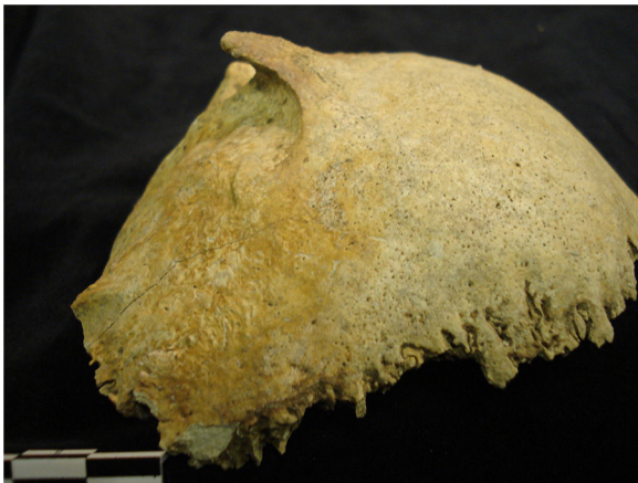
Figure 2 Dry skull image of occipital bone with type 3 EOP. Museum of London attribution to Bermondsey Abbey SK2722

and Turgut subsequently simplified into three subtypes 2 : smooth form (type 1), crest type (type 2) and spine type (type 3).