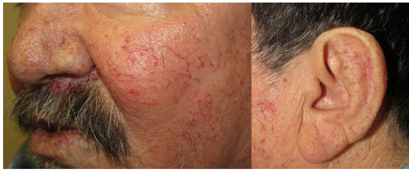
Figure 2 Multiple arborizing telangiectases on the cheek and ear.