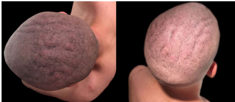
Figure 1 Anteroposterior folds forming furrows and ridges on the scalp.