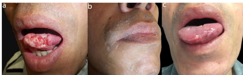
Figure 1 A, Tongue ulcer. B, Molluscoid pearly papules on the upper lip. C, Re-epithelialized lesion after treatment.

compromised patients whose specific immune response improves. 1 Pathogenesis is complex and not fully understood, although it seems that after severe immune deficiency, together with the inability to remove foreign antigens, the process is followed by immune restoration leading to a cytokine storm, a rapid increase in CD4 count, and reduced viral load 4 to 6 weeks after initiating antiretroviral therapy, thus leading to clinical expression of the symptoms. 2,3