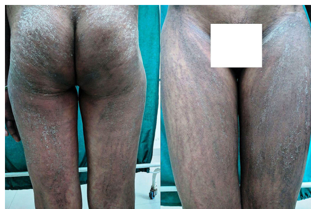
Figure 1 Flagellate erythema and linear papules with scales showing Koebner's phenomenon over buttocks (left panel) and thighs (right panel).

Still's disease is an idiopathic systemic inflammatory disorder with seronegative arthritis. Patients with 16 years of age or older having Still's disease are labeled as AOSD, whereas younger than 16 years are termed as Juvenile Still's disease. 1 Yamaguchi et al. 2 have led the major diagnostic criteria to diagnose AOSD, which include high spiking fevers \geq 39^{\circ}\text{C} for at least 1 week, leukocytosis with neutrophilia, arthralgia for more than 2 weeks, and typical skin