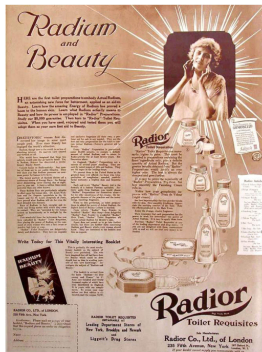
Figure 2 Advertisement for Rador’s full range of beauty products for women. https://upload.wikimedia.org/wikipedia/commons/thumb/7/70/Rador_cosmetics_containing_radium.1918.jpg/356pxRador_cosmetics_containing_radium.1918.jpg .

It is also difficult to imagine how the cosmetics industry might have handled radioactive products in an era before today’s safety regulations were in place. 8,9