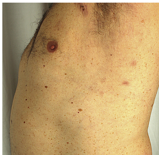
Figure 3 Residual macules in the left armpit corresponding to subcorneal pustular dermatosis lesions 3 weeks after starting treatment with adalimumab.

ND is a group of skin diseases characterized by the presence on histology of a predominantly neutrophilic inflammatory infiltrate, without evidence of infection. Each of these entities can be considered part of the same