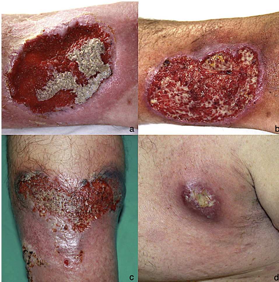
Figure 1 A, Ulcerative pyoderma gangrenosum on the right leg (April 2005). B, Ulcerative pyoderma gangrenosum on the right leg (October 2009). C, Detail of ulcerative pyoderma gangrenosum lesion (10 × 6 cm) on the left leg (July 2015). D, Ulcerative pyoderma gangrenosum in the left armpit (May 2017).